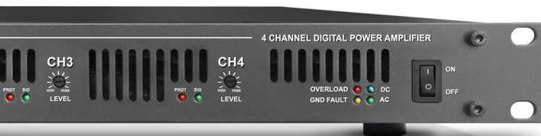
Fig. below: PA-4300DX, front and rear side