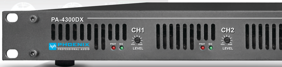
Fig.: PA-4300DX Front and rear view